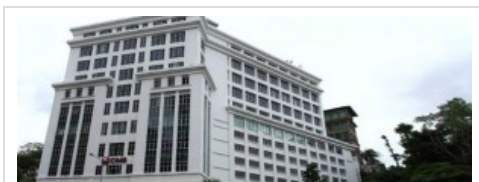
Wisma Amanah Raya Berhad will now be home to Malaysia's HELP University.

Units of Amanah Raya REIT are currently listed on the Bursa Malaysia at MYR0.89.